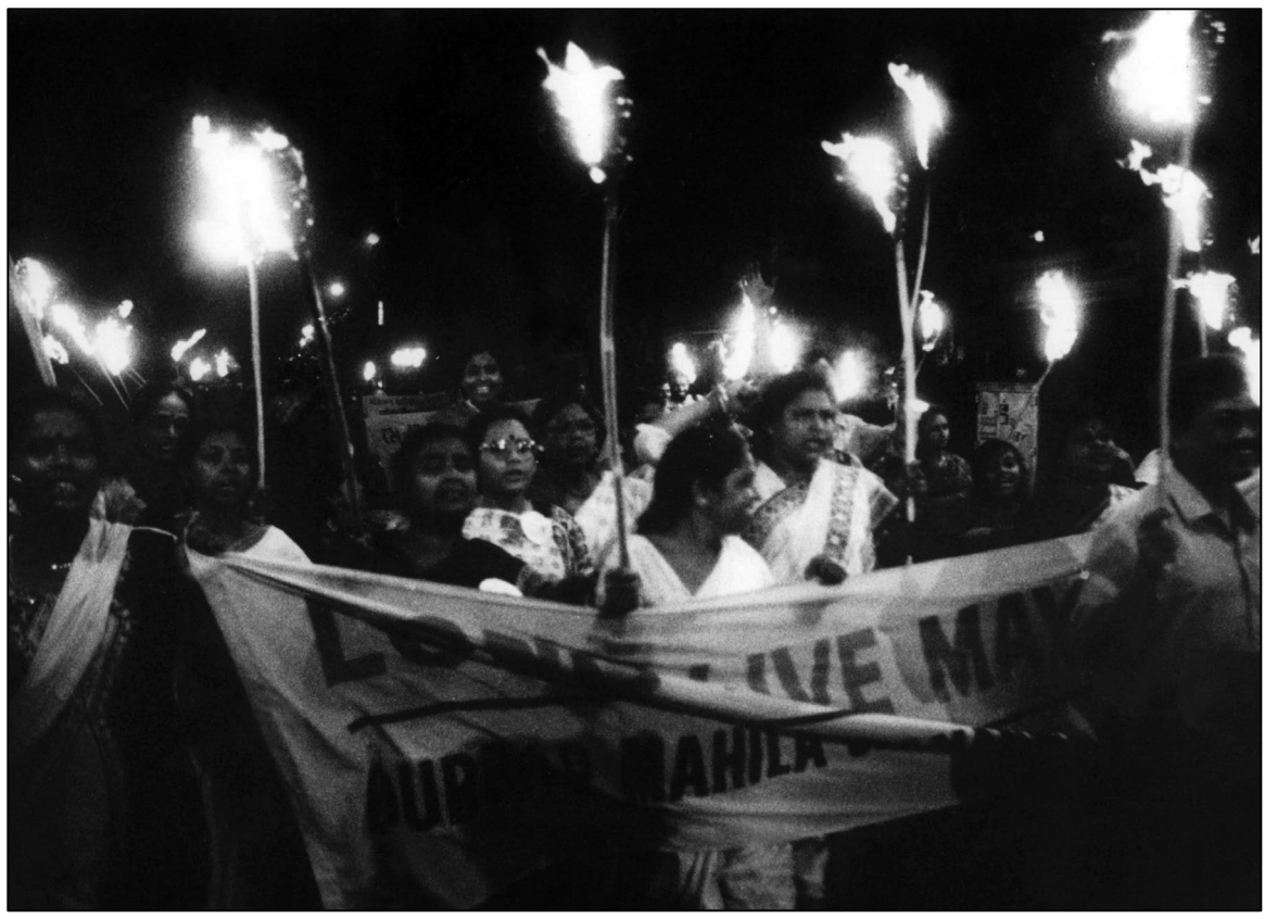
Around 600 sex workers from Durbar Mahila Samanwaya Committee marched on May Day eve (April 30, 1998) for workers' rights to be recognized including the right to constitute a self-regulatory board to prevent exploitative practices rampant in different red light areas of Kolkata.

By making sex workers collaborative partners instead of being simply targets of state intervention, DMSC reduced HIV infection rates in Kolkata's largest brothel districts to less than one percent. DMSC has been designated a best practices program by the World Bank. Dr. Jana passed away in 2021, but his work and DMSC solidarity organizing has grown into the All India Network of Sex Workers and is recognized by the Supreme Court of India to represent hundreds of thousands of sex workers, through 19 associations across 13 Indian states.<sup>10,11</sup>