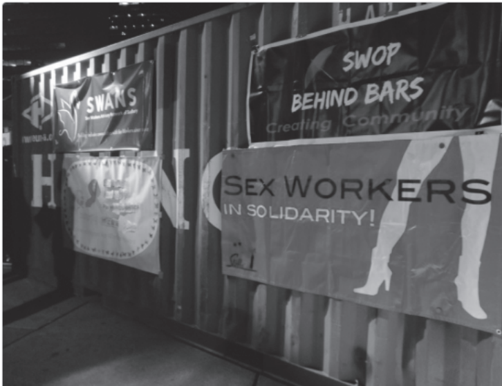
Image 5: Best Installation of the Night!