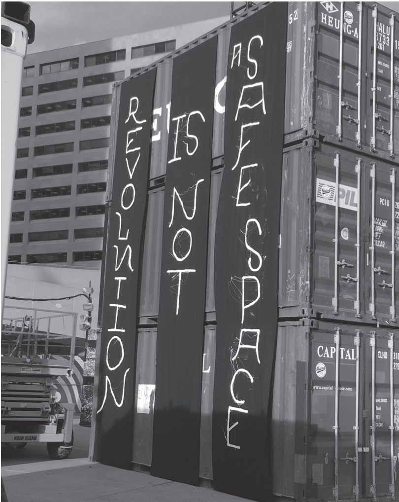
Image: 4 Revolution is not a Safe Space. Image credit: Alex Tigchelaar, 2017.

into police cars before they were born? And why should elders care that youth are being devoured by unpaid digital labour? Because revolution is not a safe space, we need to acknowledge that the fear that occupies this space often disguises itself as antagonistic bravado.