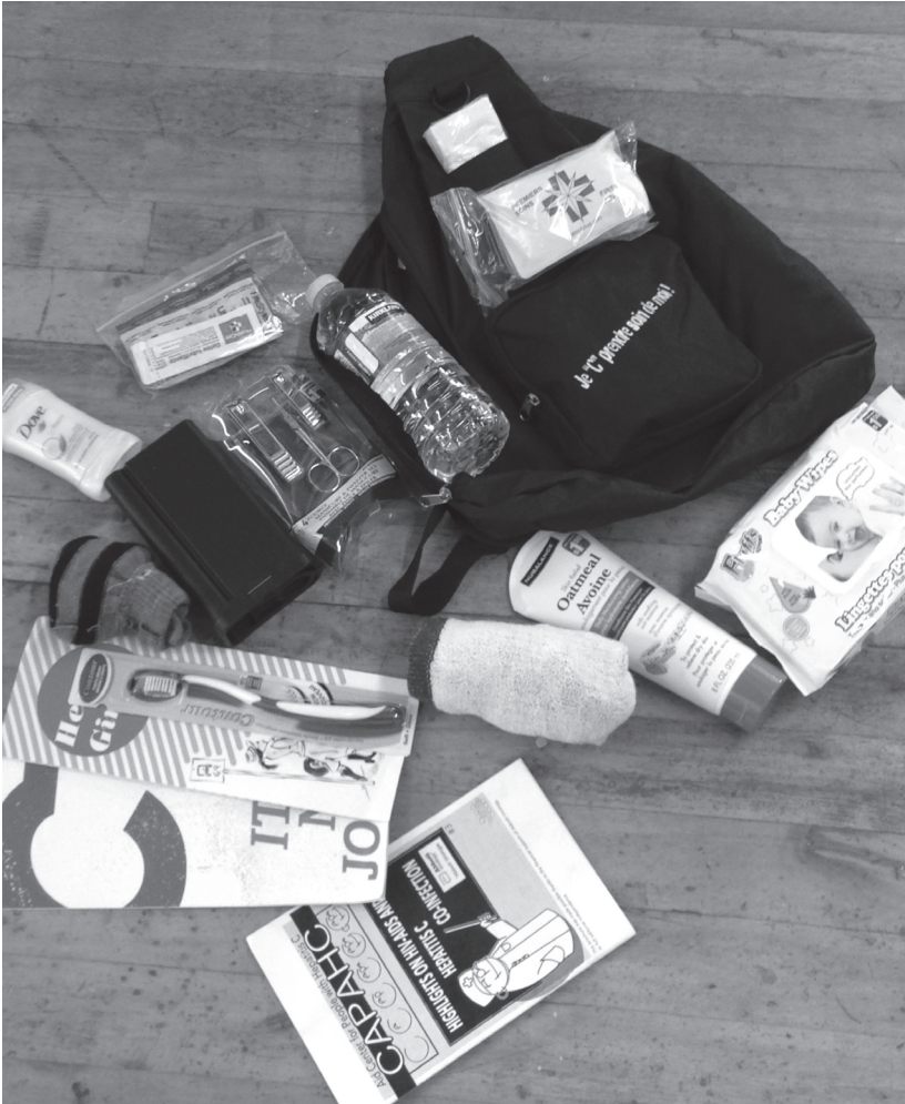
Image 2: Contents of Je “C” Prends Soins de Moi!

At its core, all of Stella’s activist engagement recognises what sex workers need to work safely and comfortably, and the organisation supports them in this, be they working on the street, in massage parlours, for agencies, independently, or in strip clubs. Because of its long and highly imaginative record of outreach, Stella members were tasked with administering the ‘sex work library’ for The Viminal Space . They would be the ‘Stellibrarians’ and would give a visual and literary account of their twenty-two years of history, service, and activism.